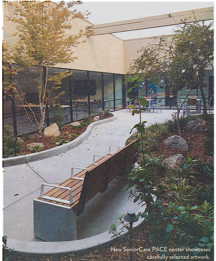
New SeniorCare PACE center showcases carefully selected artwork.