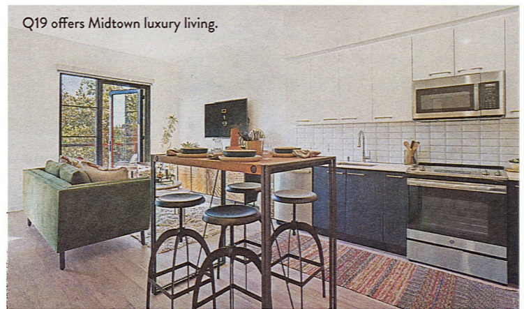
Q19 offers Midtown luxury living.